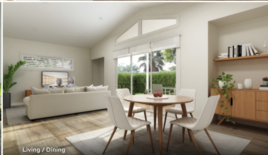
Living / Dining